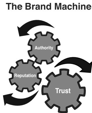
Figure 3.1 Trust, reputation, and authority are central components in the establishment of brand equity.

As Figure 3.1 illustrates, the three cogs of trust, reputation, and authority also make up your brand machine.